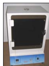
Laboratory Dryer LD