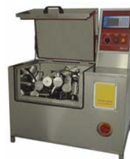
Infrared Laboratory Dyeing Machine IRD III