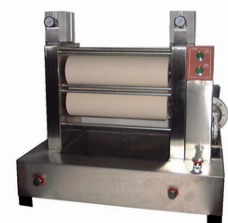
Laboratory Padder LP