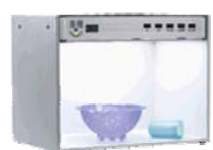
Light Cabinet QC